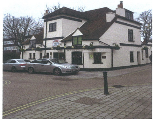
Public House Opposite FP51