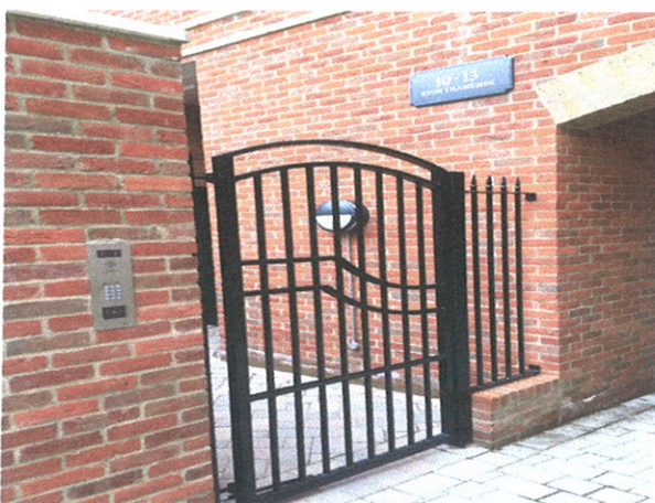
Main entrance Eton Thameside 10-13.