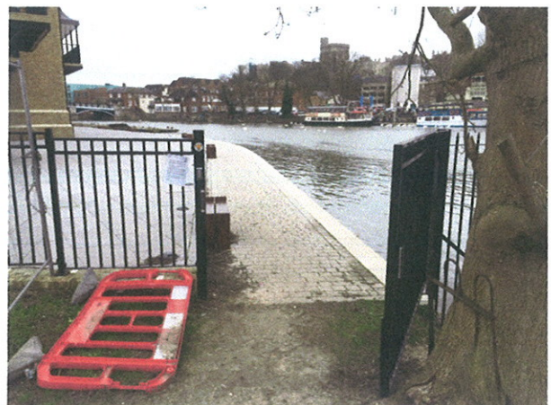
FP51 Facing From Brocas Meadow (Position C Appendix 1)