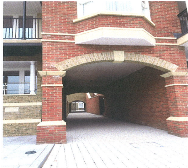
FP51 Facing From Riverfront (Position B)