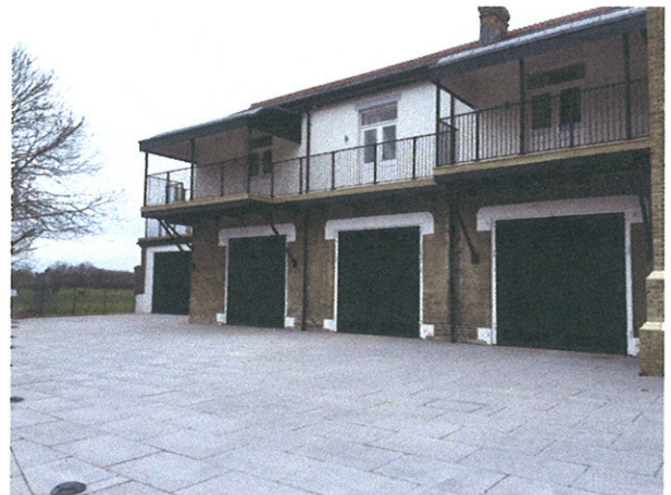
Storage Units on FP51