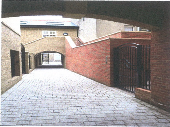
FP51 – facing North towards Brocas Street