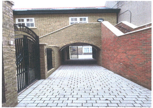
FP51 – facing North towards Brocas St