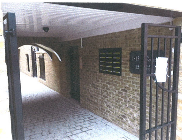
Main entrance / Post Boxes / Post Room & disabled access.