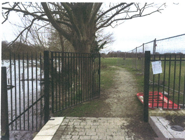
FP51 Gate Facing to Brocas Meadow (Position C Appendix 1)