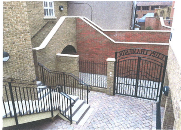
Steps – Down from Podium to Exit onto FP51 Down from Podium and immediately left to Fire escape