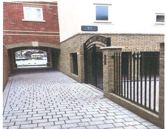
Main entrance Eton Thameside 1-9