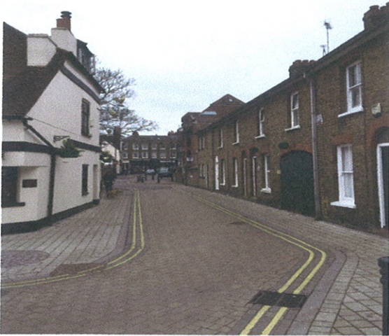
Brocas Street Facing West