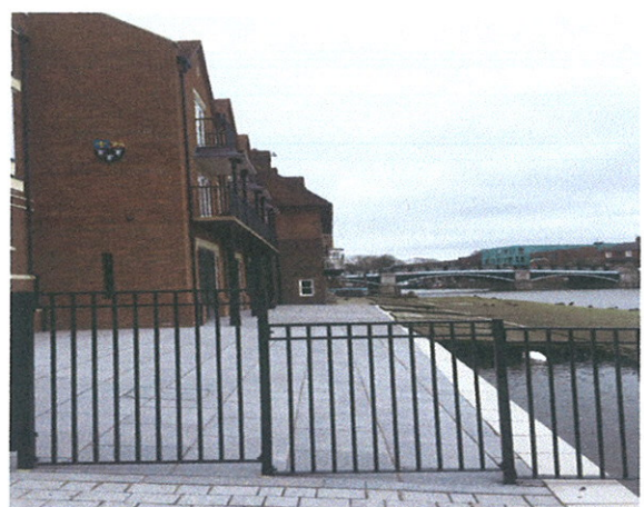
Eton College BC (Position B Appendix 1)