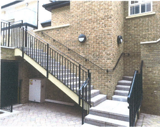
Steps – Left to Podium. Right to Fire. Escape.