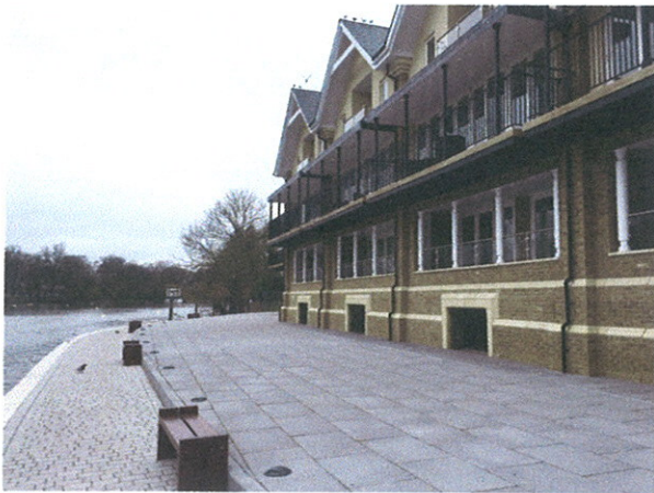
River Front Properties